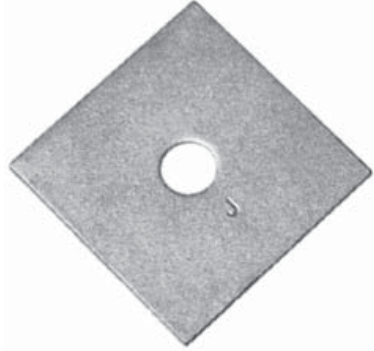
Square Flat Washers