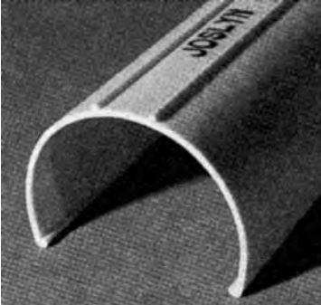
J1491Y and J1498Y